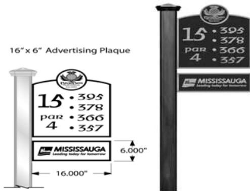
Production Contact: Alchemy Fusion 905-858-0731. $300 per tee marker.

*Cost of design and production of tee marker not included