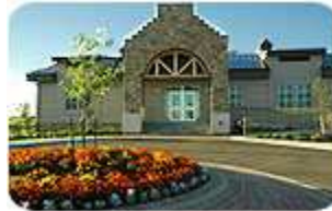
BraeBen Golf Course

Second largest City in the GTA Current Population: 780,000