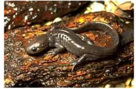
Jefferson salamander ( Ambystoma jeffersonianum )

Cawthra Woods supports a diverse community of wildlife and vegetation including the Jefferson salamander, a unique species in areas of Ontario protected under the Endangered Species Act, 2007 .