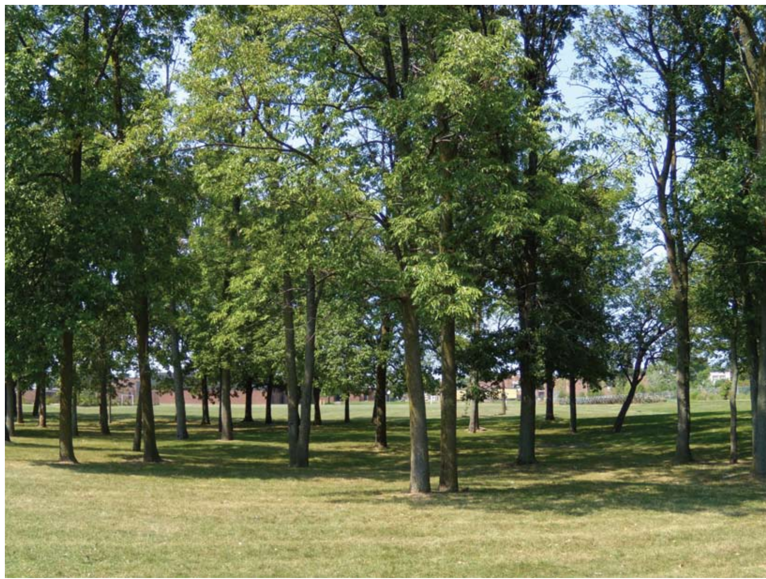
Woodland Meadows Park

http://www.mississauga.ca/naturalheritage