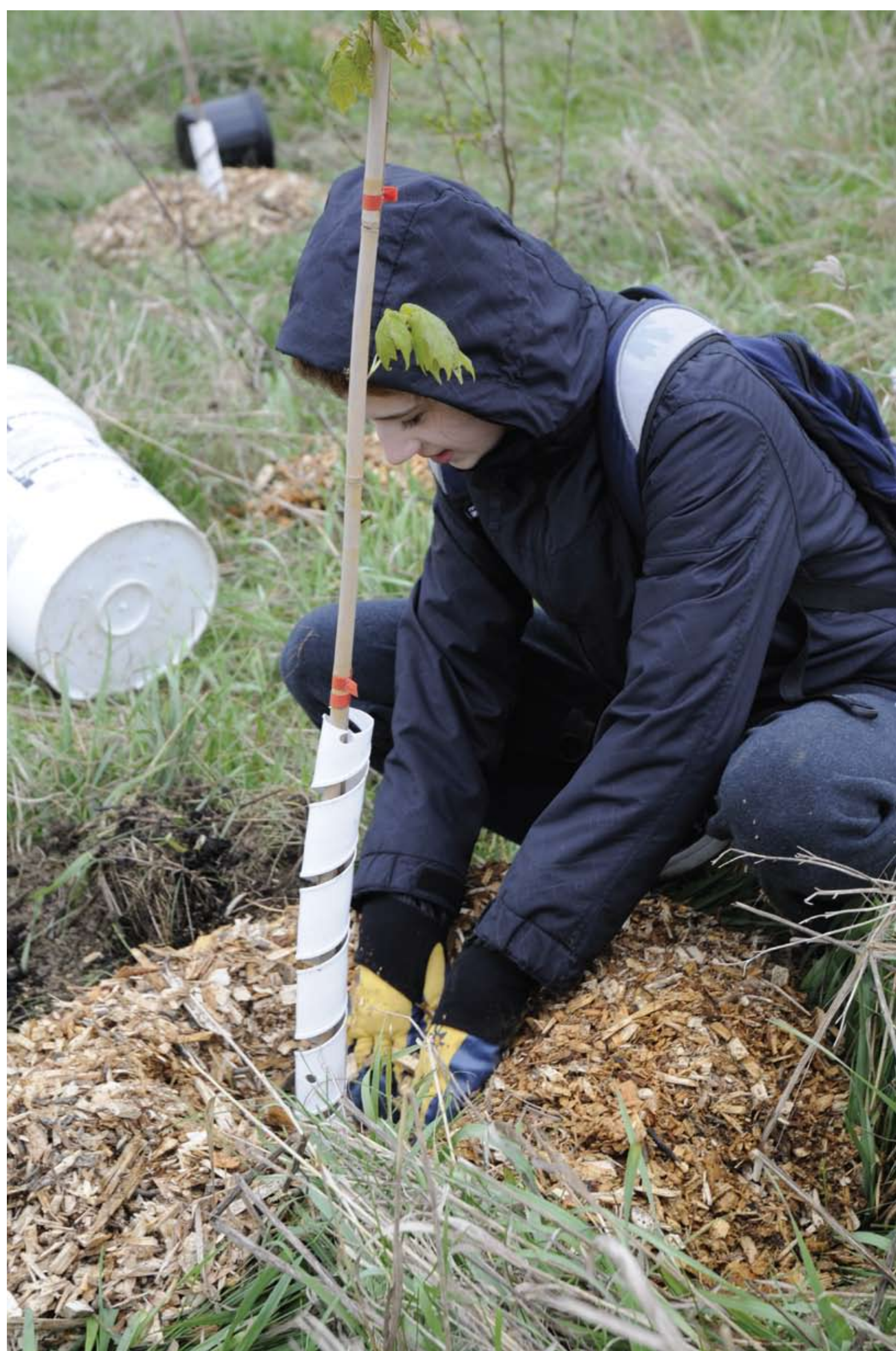
Earth Day planting at Erindale Park