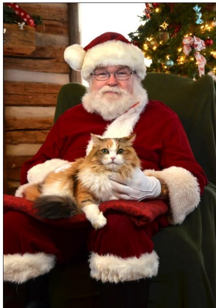
Volunteers favourite kitty in her white mittens!

Special Thanks to all of you who made this event so much fun, and successful too!