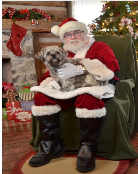
Museums Staff favourite of the dogs that came on Saturday.