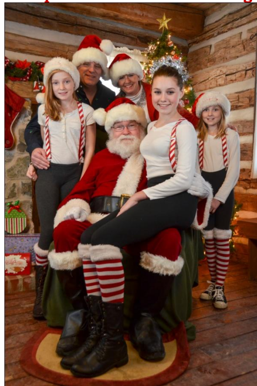
This Dad and Mom brought their family of Elves to pose with Santa at the Log Cabin.