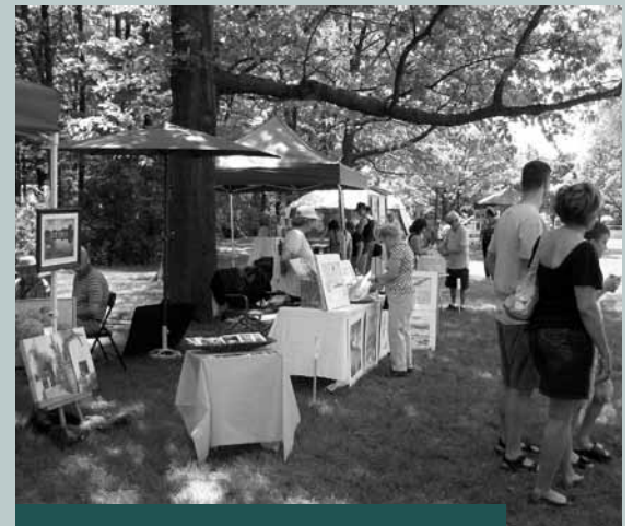
Many talented artists participated in the Friends of the Museums' Gallery in the Garden and Strawberry Social on June 5th at Benares.