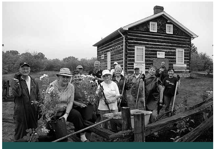
Special thanks to members of Streetsville Horticultural Society for planting the gardens at Leslie Log House since its opening in May 2011.

A variety of locations throughout Mississauga open their doors for this one special day. The Museums of Mississauga and Streetsville Historical Society will act as hosts at our newest museum location, the Leslie Log House, located at 4415 Mississauga Road.