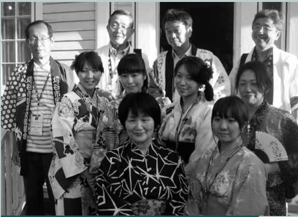
Kariya's Delegation to Mississauga attended the opening of "Celebrating Friendship" exhibition on June 30.