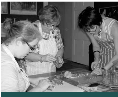
Sweets and Sours program participants making pickled asparagus.

We're looking towards a Fall that's very full of programming at Museums of Mississauga! We've got education programs for all grade levels, children's programming for Guide and Scouting Groups, Log Cabin Overnights, monthly Afternoon Teas and pre-registered workshops for children and adults.