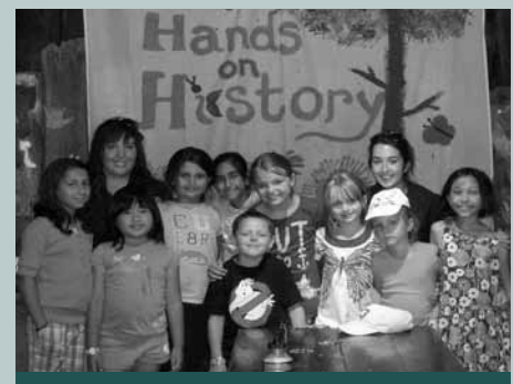
Lots of fun this summer at the Hands on History Day Camp.