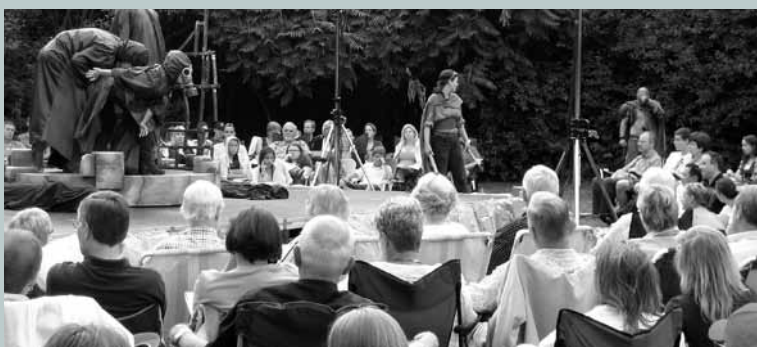
Driftwood Theatre presented Macbeth at both Bradley Museum and Leslie Log House this summer.