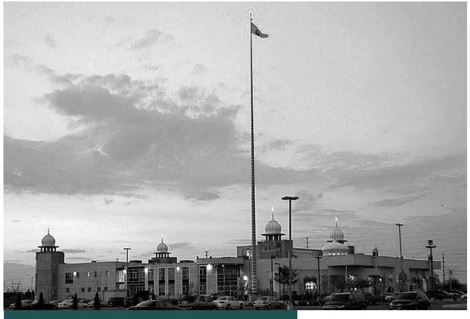
Ontario Khalsa Darbar