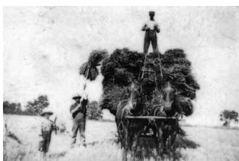
Haying in Merigold's Point, now part of Clarkson.

existed in what now seem as some of the most unlikely places. In many cases, sadly, little to nothing remains to mark the existence of the village where many people lived and worked. Ironically, in some cases the only thing remaining of the village is a cemetery, established when the community thrived and now left to remind us truly of what and who has passed. It is as if death was the only marker we would not let time eradicate.