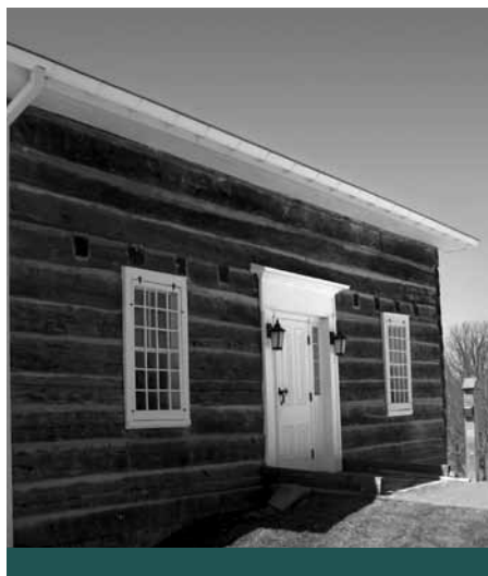
The Leslie Log House opens May 14

The Museums of Mississauga will provide curriculum-based educational programming as well as special events and regular "drop