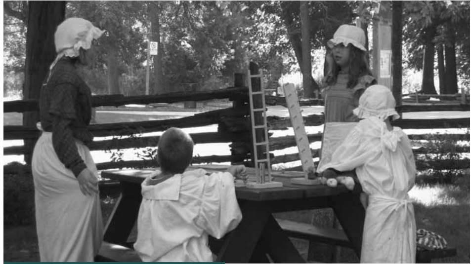
Hands on History Day Camp runs in July and August at the Bradley Museum.

Hands-on History Day Camp for 7 – 12 year olds will be at Bradley Museum this coming summer. Camp weeks start on July 4, with the final week beginning August 29. During the camp children learn about history in a fun hands-on way with theme days and