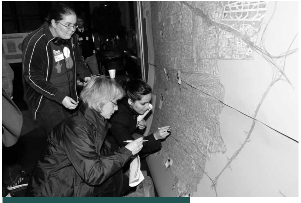
At the Culture Master Plan Public Consultation in October 2008, culture stakeholders identify Mississauga cultural resources on a map.

The City of Mississauga is developing its first Cultural Resource Map. There are so many