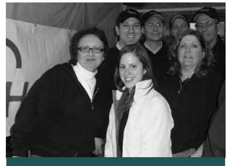
Holcim Canada Inc., sponsors of Maple Magic spent an afternoon flipping pancakes in the Log Cabin.

Other events to mark in your calendar are: Saturday July 2, the Bradley Museum hosts 'Tedfest' a BMW Car show. Driftwood Theatre group is at Bradley Museum on July 15 and 16, and will also be performing at the Leslie Log House on Friday August 12. The ever popular Teddy Bear's Picnic will be held on Sunday July 24 from 12 pm to 4 pm at Benares Historic House. We are continuing