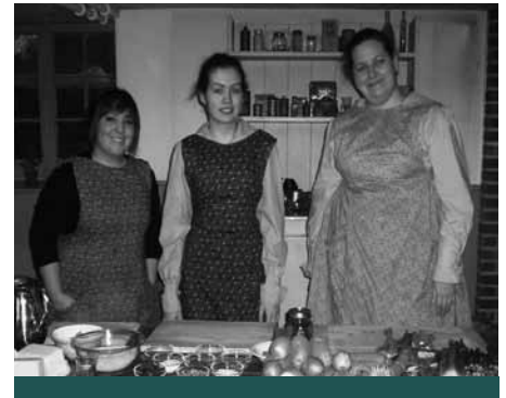
The Museums have a variety of pre-registered programs led by our historic interpreters.

Once a month we are also offering Teas and Tours at Bradley Museum. Spring and summer dates are: May 29, June 19, July 17 and August 28. Come spend an afternoon