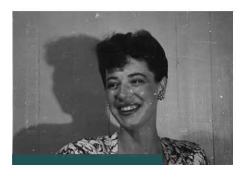
U.S.O. Camp Shows, Honolulu, 1945