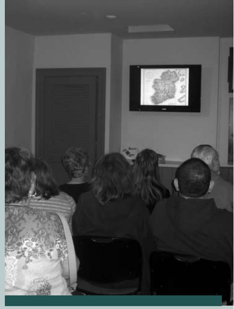
Fall Festival and Doors Open were a big success at the Museums on September 18. 140 people attended at Benares Historic House where the highlight was our new award winning DVD. 563 were in attendance at Bradley enjoying the demonstrators, music, crafts and more.