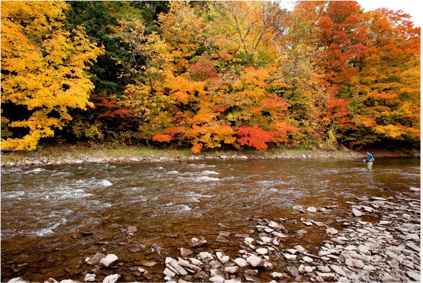
Figure 6-1: As an environmentally responsible community, Mississauga is committed to environmental protection, conducting its corporate operations in an environmentally responsible manner and promoting awareness of environmental policies, issues and initiatives. Residents and businesses have a large role to play to help protect and enhance the land, air, water and energy resources that are enjoyed by all in the city. (Credit River Valley)